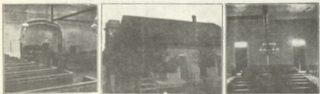
BAPTIST CHURCH, WALHALLA, S. C.