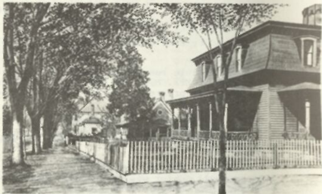
RESIDENCE SECTION, SENECA, S. C.