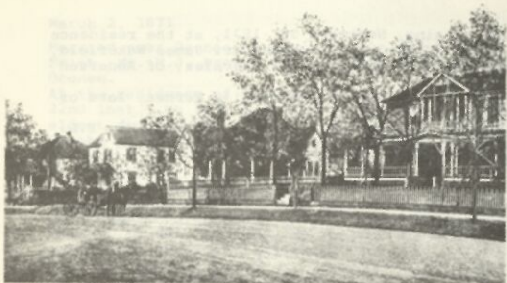
WALHALLA STREET, SENECA, S. C.