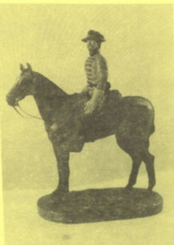
The statue is approximately 12" tall from the base to the top of the hat.

Let's Remember Our Confederate Soldiers In A Special Way